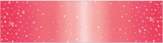
Hot Pink - 10870 14