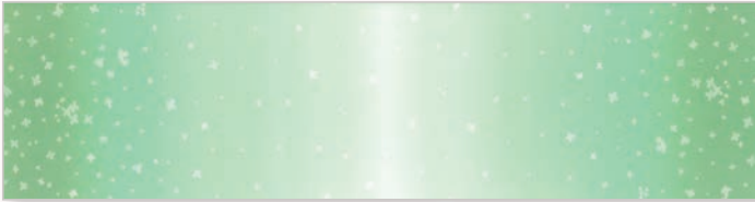
Mint - 10870 210