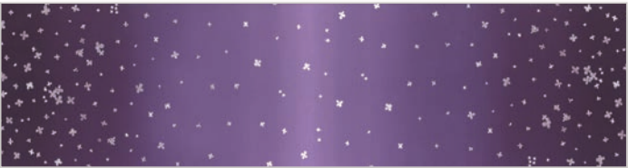
Aubergine - 10870 224