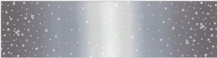
Graphite Gray - 10870 13