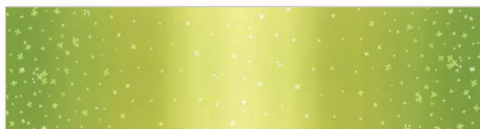
Lime Green - 10870 18