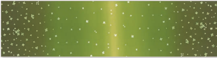
Avocado - 10870 52