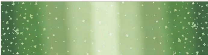
Evergreen - 10870 324