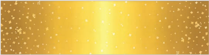
Mustard - 10870 213