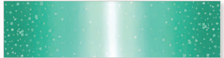
Teal - 10870 31

VC 128 / VC 128G LOVELY OMBRE CABINS 75" x 92" - FQ Friendly