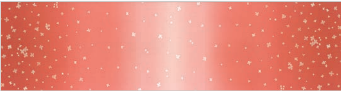
Persimmon - 10870 216