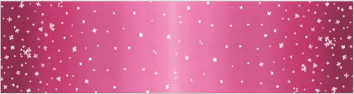
Magenta - 10870 201