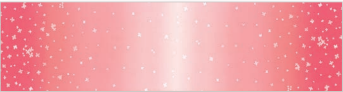
Popsicle Pink - 10870 226