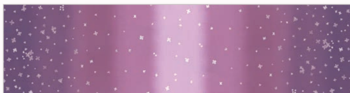
Mauve - 10870 319