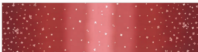
Mulberry - 10870 316