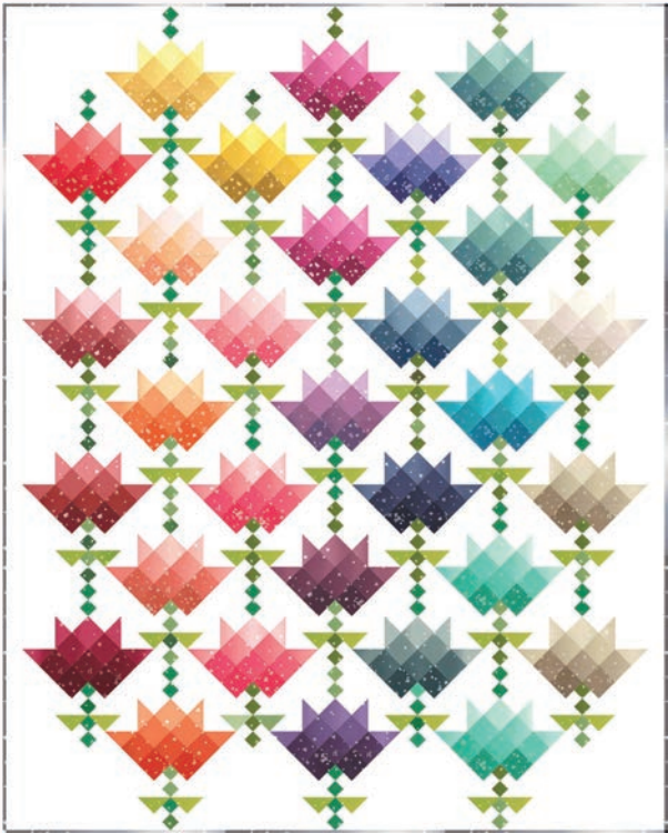
VC 127 / VC 127G OMBRE FLOWER BOUQUET - 57" x 71"