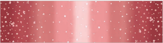
Cranberry - 10870 318