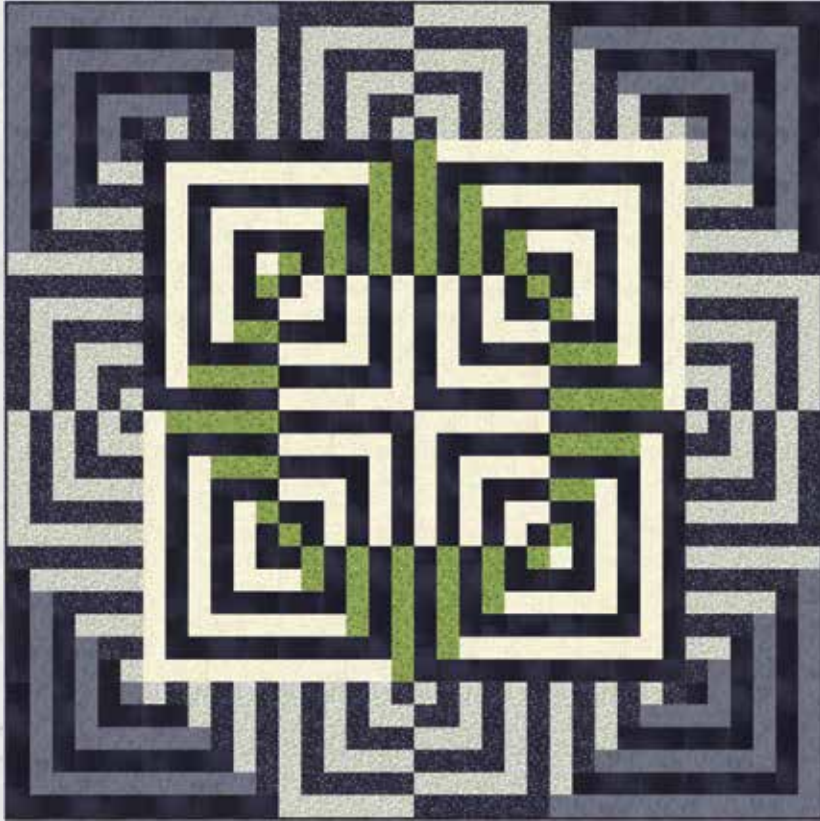
JC 204 - Mizmaze 72" x 72"