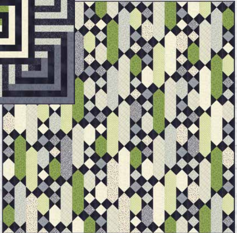
JC 205 - Meander 72" x 72"