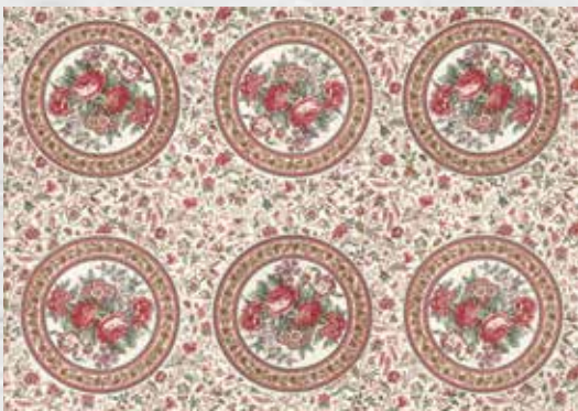
42340 11 * reduced to show full repeat. Medallion measures approx. 8.5"