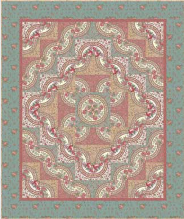
AQD 0271 - Panel Magic 58" x 69"